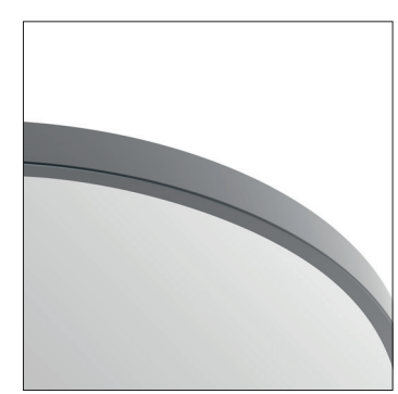
OP opal diffusor